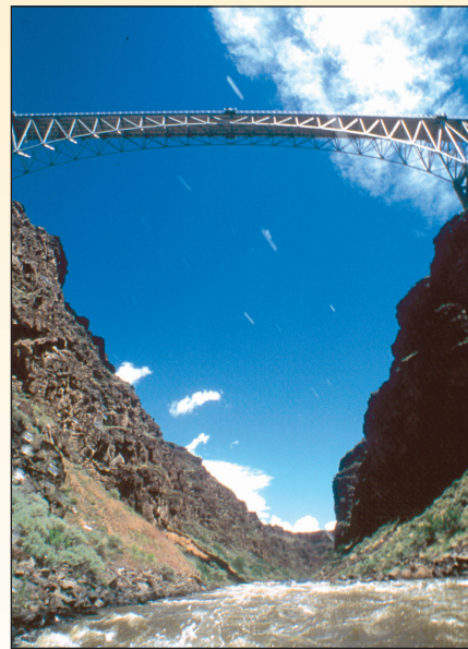
The Rio Grande Gorge Bridge

Traveling through the Moreno Valley from Eagle Nest, the next stop is a visit with the ghosts in Elizabethtown. Established as the first incorporated city in New Mexico in the late 1860's, Eliza-